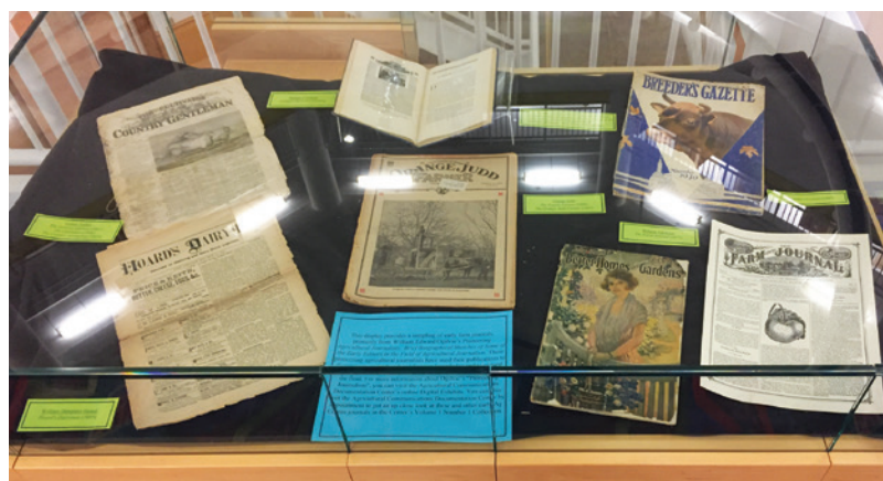
Pioneering Agricultural Journalists display in Funk ACES Library