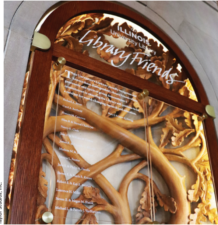
Taylor Studios, Inc.

The donor wall was created for the Library by Taylor Studios. The design was inspired by the tree imagery that appears on the exterior of the Main Library building above the east entrance.