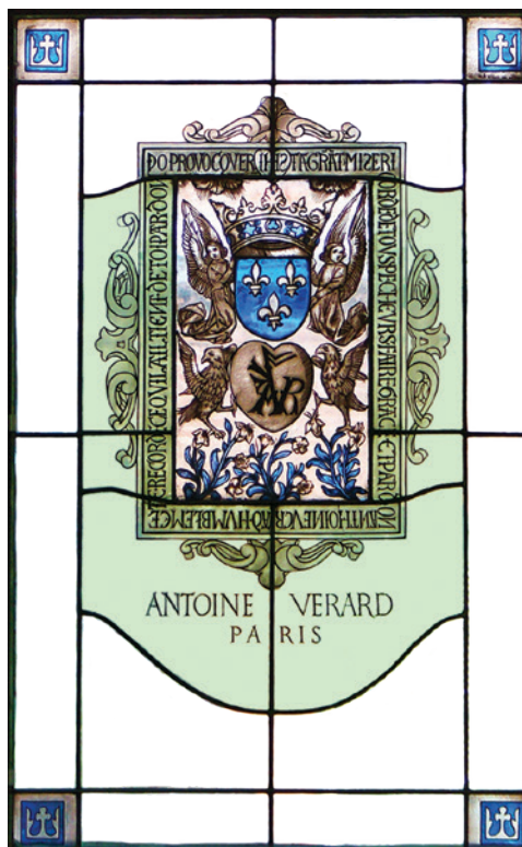
The detailed mark of French printer Antoine Vérard features birds, angels, hearts, the royal crest of France, and the hellebore plant—also known as verart —which evokes the printer's name.