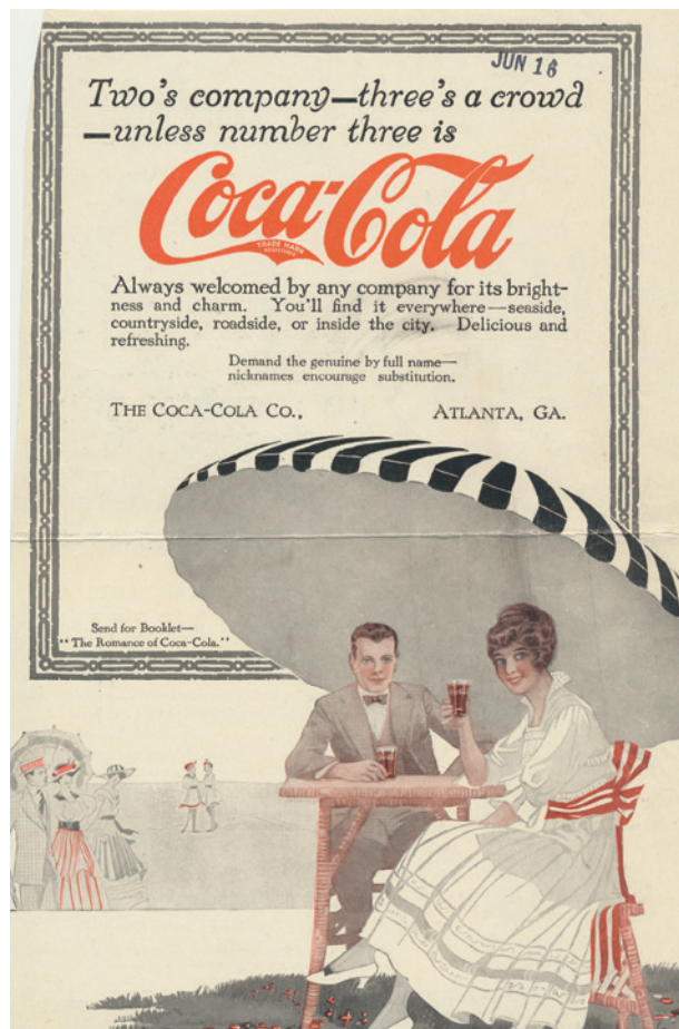
The Ad Council Archives, as well as the Woodward, D'Arcy, and Cohen collections, position the University Library as a leader among institutions with advertising archives.

But the breadth of the collection was also its very downfall. Only roughly organized by topic, the advertisements arrived stuffed into old filing cabinets and boxes. Over the years, Romero had completed some preliminary inventorying of the collection's categories, which represent nearly