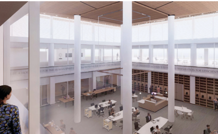
Artist’s concept of the renovation