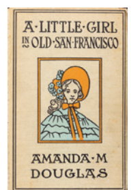
Titles from the Nina Baym Western Women Writers Collection

"The point of collecting materials from underrepresented communities is to provide a broader and better and more inclusive understanding of our own collective history."