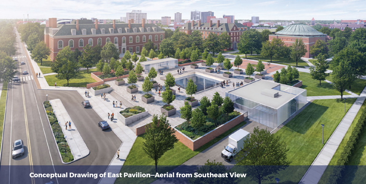
Conceptual Drawing of East Pavilion—Aerial from Southeast View