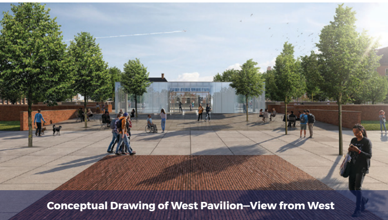
Conceptual Drawing of West Pavilion—View from West