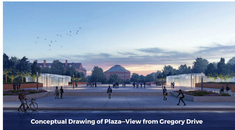
Conceptual Drawing of Plaza—View from Gregory Drive

Sciences, Health, and Education Library (Rooms 100 and 112) will be renamed, rewired, and reconstituted as study space for 300 students. This floor will also host the Writer's Workshop, loanable technology, consultation, and technology support, with other floors accommodating additional services.