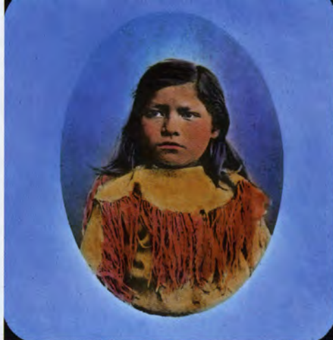
Carlos Montezuma, the first American Indian graduate of the University of Illinois, is shown in this 1874 photo at age 8.

Montezuma gained a measure of acceptance in Urbana. Joining the Adelpic Literary Society, Monte (as he was nicknamed) overcame an initial “tendency to embarrassment” and soon won acclaim for his oratorical prowess, for his “mastery of a tongue not by any means a mother one to him,” according to the literary society’s records. In May 1883 he delivered a speech on “Indian’s Bravery,” one of the high points of his college days. “The most vivid, pathetic, and beautiful picture ever painted in our Hall, was ‘Monto’s’ [sic] in his description of the Indians in America before the arrival of the white man,” the student newspaper gushed. Capping his University career, Monte was elected president